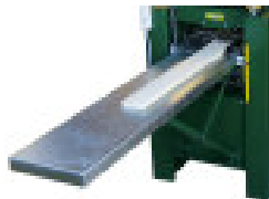
In & out feeding tables steel, move up and down with the machine table