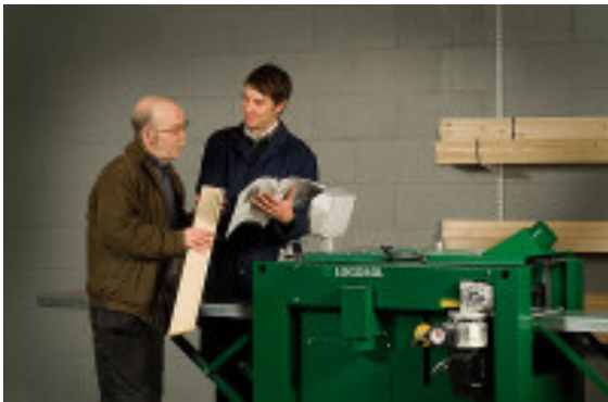
Short setup times

PRODUCING PANELS and mouldings from wood is a simple and profitable way to refine wood. Logosol PH260 planes and profiles four sides at once. You can quickly and easily produce all imaginable standard and specialised profiles. As it is easy to reset the cutters, PH260 is perfect for short customized series. One difference between PH260 and traditional multi-cutter planers is that the upper and lower cutters are suspended at both ends. Due to this, the machine is extremely stable, even though it has considerably wider cutters than most large planing machines. The planing table, where the lower and side cutters are placed, is made of heavy cast iron. The machine cabinet is made of 4 mm sheet steel. The machine is basically rust proof for outdoor use and minimal maintenance.