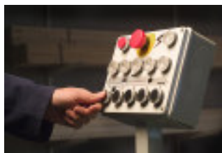
Each motor is started individually