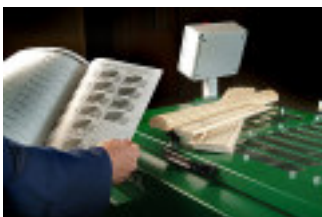
Endless variety of profiles