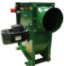
Chip extractor 3 kW suitable for the PH260. 2500m 3 /hour

When delivered, the planer is ready for squaring. It is set up with HSS planing knives in the upper and lower cutters, and 55 mm HSS planing knives in the side cutters. The 30 mm spindle diameter of the side cutters enables you to choose from a number of other cutter systems on the market today.