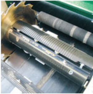
Profile knives are mounted in the cutter.

With the Soloplaner you can process sawn boards into an endless variety of profiles. About 200 standard profiles, and blanks in case you want to make your own profiles, are available from the Logosol catalogue. The clamping design is universal and knives and blanks are also available from many local suppliers. The Logosol knives are of HSS quality and they remain sharp for between 3000-6000 board metres depending on the hardness of the wood. The knives can be sharpened 5-10 times.