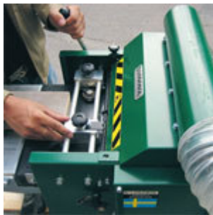
Height and width are adjusted in two simple operations.