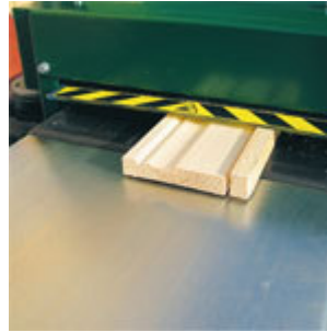
The circular saw rips the board into the chosen width at the same time as the profile knife mills the board.