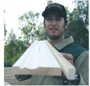
From a plain, unprocessed board you have now got a valuable moulded product with a nice profile.